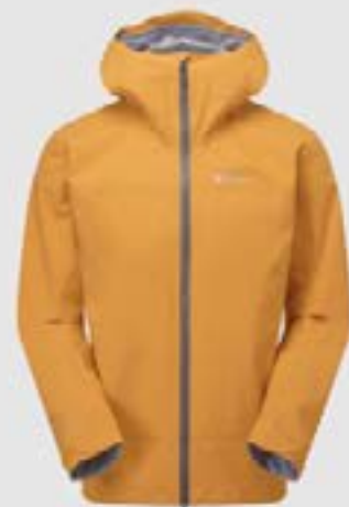
phase xt jacket mens